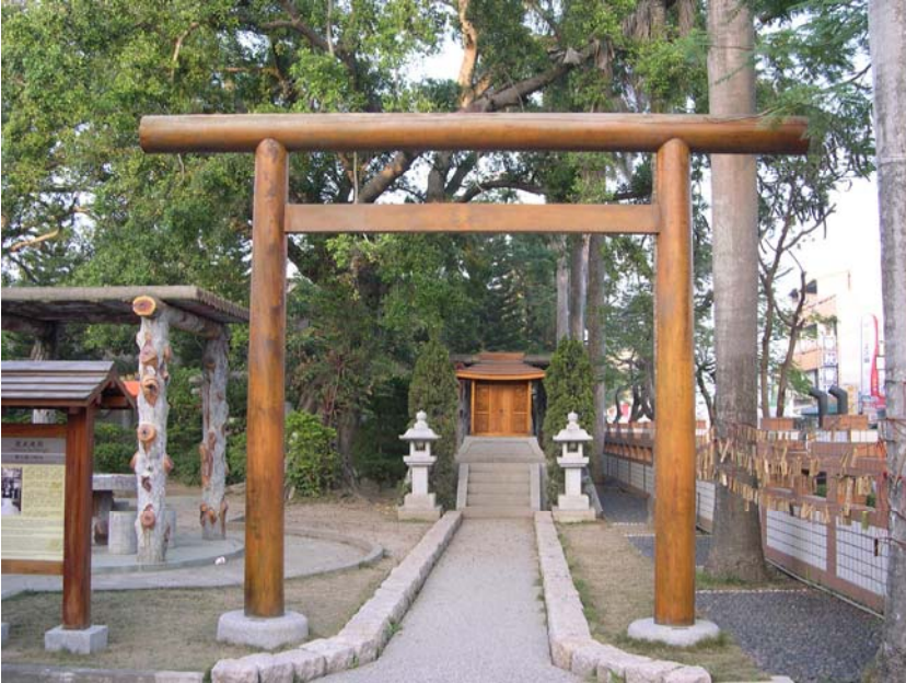
Figure 1: The Second Generation Yanshui School Shrine