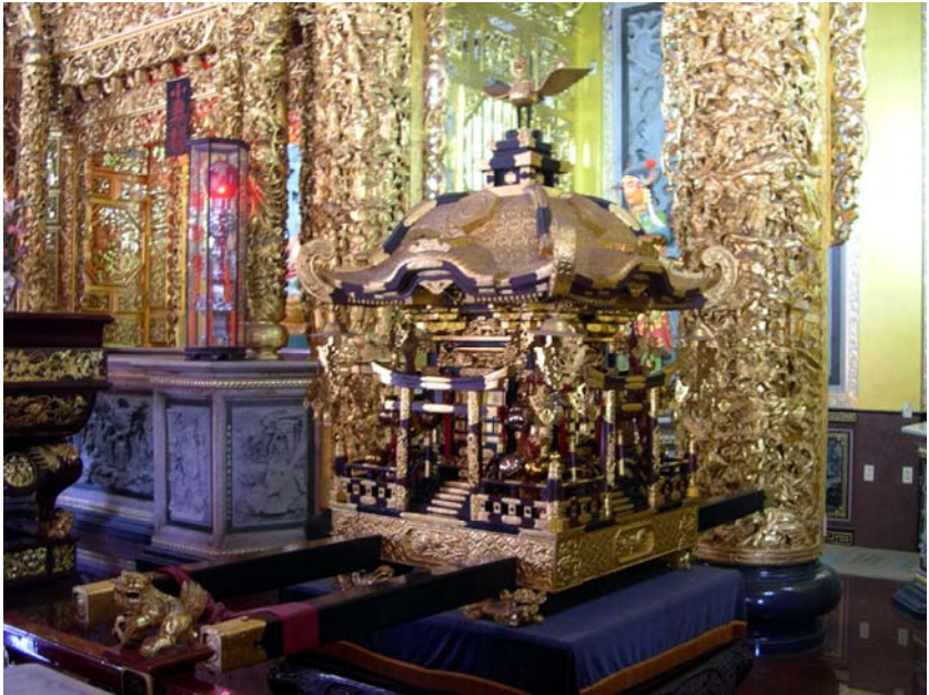
Figure 19: A Golden mikoshi

built in 1935, the temple, which was erected at the site of where the shrine once stood, adopted the mikoshi as well as the stone lions. The mikoshi is gilded and, as the red cloth tied around the handles indicates, it is treated as a deity among other gods (see Figure 19). This is rather hard to comprehend considering that the temple was once destroyed by the Japanese authorities in 1937 in their Kominka efforts (Liu 2010: 35). The Gangshan mikoshi presents an excellent example of the hybridization feature in the preservation of Japanese heritage.