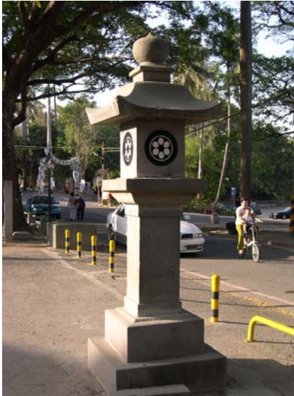
Figure 9 (left): The “Resurrected” Qiaotou Shrine lantern; Figure 10 (right): The Prewar Stone Lion

group hopes to fully restore the structure with the financial help of the CCA ( Liberty Times 2009b).