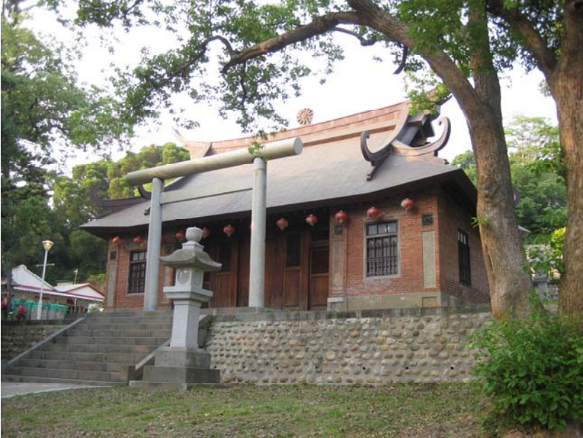
Figure 8: The Second Generation Tongxiao Shrine

the roof is crowned with a KMT emblem. The Chinese flavour is blended with that of the Japanese, represented by the remnants of the Shinto shrine, such as the stone gate ( torii ) and the stone lanterns.