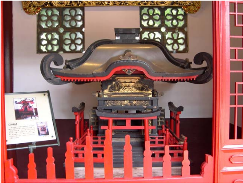
Figure 16: A Japanese mikoshi