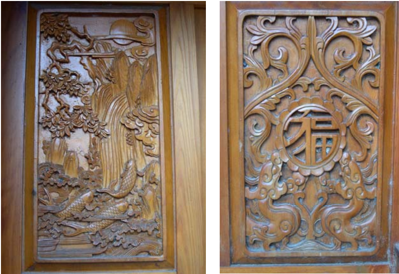
Figure 2 (left) and 3 (right): Chinese Carvings on the Shrine