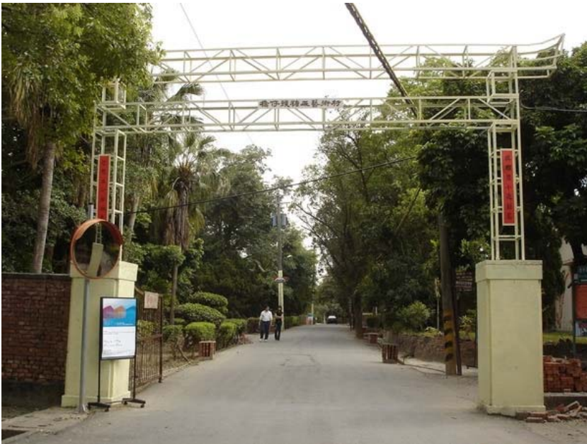
Figure 11: A Steel Pipe Torii