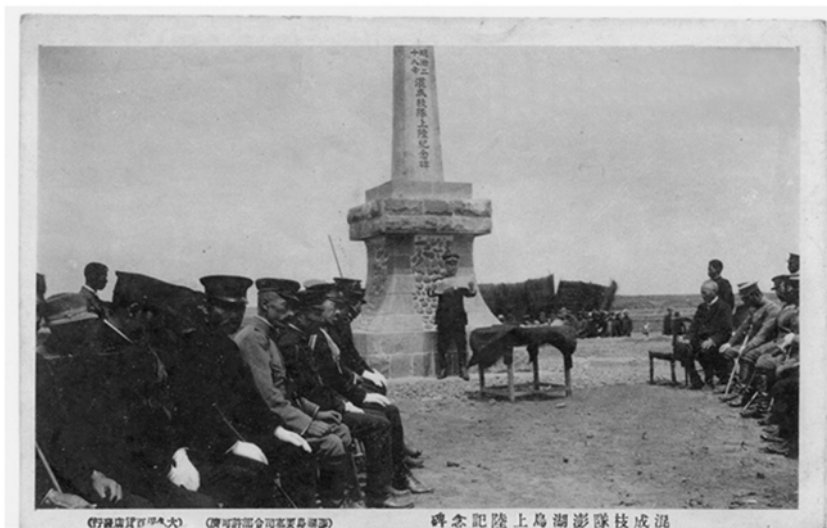
Figure 30: Commemorating the Landing of Japanese Troops on the Penghu Islands

2010). The third monument was erected in 1932 in Tainan, where Fukushima stayed for 47 days (Wu 2000: 99). The monument was later moved to and displayed in a local museum. It was then relocated to the National Taiwan History Museum in Tainan when the local museum reopened as a Hakka cultural museum in 2010.