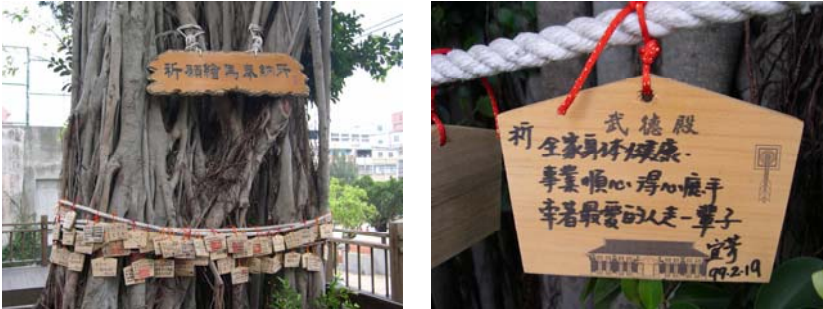
Figure 24 and 25: Emas around the Banyan tree

items that represent Japanese martial arts culture, and it serves as a small cultural museum. The institution contributes to the promotion of cultural exchange between Taiwan and Japan; many Japanese martial arts practitioners and art performers have visited Gaoxiong on several occasions since its opening in 2005. The Gaoxiong Butokuden has hosted the annual International Cities Kendō Competition since 2007 ( Epoch Times 2007).