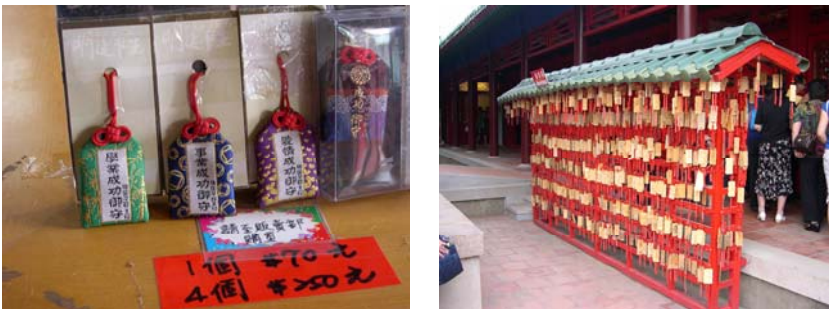
Figure 17 (left): Japanese-style omamori ; Figure 18 (right): Emas Hung in the Shrine's Courtyard