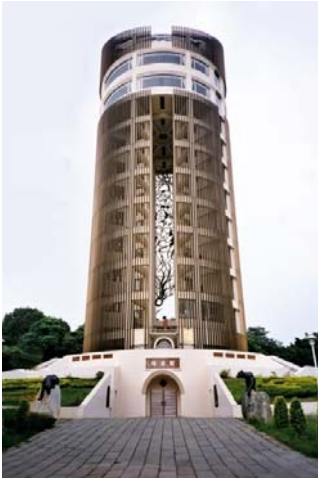
Figure 14 (left): Chiayi (Jiayi) Tower; Figure 15 (right): The “Sacred” Formosa Cypress on Ali Mountain