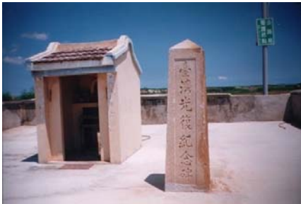
Figure 31 (left): A Shrine and the Taiwan Restoration Monument Figure 32 (right): The Third Generation Monument

地公, tudi gong ) has been built at the site (see Figure 31). The stone monument since then has stood rather awkwardly beside the shrine. After the Penghu County Government designated the monument a historic site in 2000, a new monument with the original inscription was built in 2004. The original stone with the postwar KMT inscription has been placed next to the new monument (see Figure 32). The Penghu County Government boasts that the monument is the oldest Japanese war monument in Taiwan, even though only the revised headstone (not its inscription) is original.