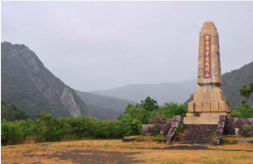
Figure 5: The Stone Speaks a Different Tongue

Note: The prewar inscription 西鄉都督遺蹟記念碑 ( Saigō totoku yiseki kinenhi , Memorial on the historic site of General Saigō) was changed into 澄清海宇還我河山 ( Chengqing haiyu huanwo heshan , Clear the Oceans and the Skies, Return My Rivers and Mountains), Pingdong County.