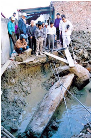
Figure 29 (right): A Monument Commemorating the Landing of Prince Sadanaru