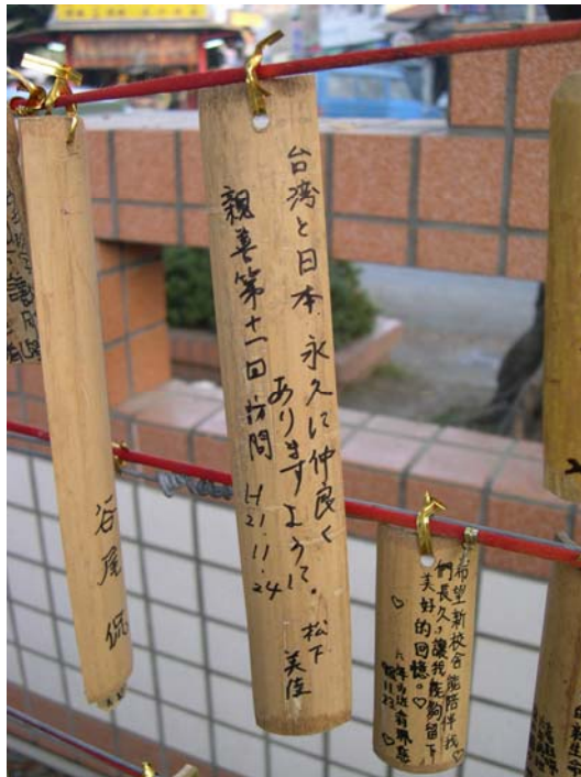
Figure 4: Bamboo Tablets on the Wall

Note: This particular one written in Japanese reads: “May Taiwan and Japan be friendly to each other forever”.