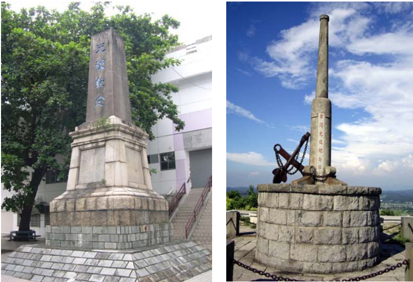
Figure 6 (left) and 7 (right): The Stone Speaks

Note: Figure 6 (left): The letter “光復紀念” ( Guangfu jinian , Commemorating Glorious Recovery) appears on what was formerly a memorial of fallen Japanese soldiers (忠魂碑, Chūkōnhi ) in Pingdong Park. Figure 7 (right): Glorious Recovery of Taiwan Monument (台灣光復紀念碑, Taiwan Guangfu jinianbei ) on the hill top of Tongxiao Park, Miaoli County. It used to be a monument celebrating Japanese victory in the Russo-Japanese war (1904-1905).