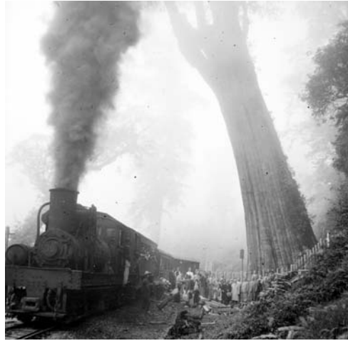
Sources: Figure 14: © Yoshihisa Amae; Figure 15: Chiayi Community Blog 2010.

Located on the side of the mountain, the Gaoxiong Shinto Shrine has provided the dead and living with a spectacular view of the harbour city since 1928. The Japanese shrine was also converted into a martyrs’ shrine after the war. Yet the area is full of remnants of the Japanese shrine such as stone lions, lanterns and monuments. During the Japanese era, the building located next to the shrine was a storage facility where instruments for Shinto rituals were stored. In 1980, it was turned into the Historic Exhibition Hall of the Revolutionary Heroes, displaying historical materials related to Sun Yat-sen, the 1911 revolution, the KMT Northern Expedition, and the wars against the Japanese and the communists (Fan 2005: 155). In 2006, the exhibits were rearranged and opened as the War and Peace Memorial Museum. Compared to the previous exhibits, which focused only on the KMT soldiers and their war efforts, the new exhibits illuminated the history of wars in Taiwan and how they affected people’s lives. In other words, the perspective of the exhibition shifted to become that of the local people in Taiwan, no longer that of the rulers. The paradigm shift redefined Taiwanese heroes. An excellent example that highlights this point is one of the exhibits, entitled “Commemorating Wars: Who left behind a good reputation?” The caption reads: