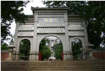
Figure 12 (left): The entrance gate to the Martyrs’ Shrine; Figure 13 (right): The entrance gate of the Chiayi (Jiayi) City Historical Relic Museum

The main shrine palace, which enshrined nationalist war heroes after the war, burned down in 1994. Instead of repairing the shrine, the city government took the opportunity to build a 62-metre-high tower, of which only the first floor space is dedicated to the martyrs (see Figure 14). The round tower is shaped like a shenmu (神木, sacred tree) which once stood on Ali Mountain (see Figure 15), and it carries a motif of the “shooting down of the evil sun” from an Aboriginal myth. Local history tells that the site where the tower stands was once used as an altar for the Aborigines (Chen Wenqi 2004: 45). The tower space serves as an art gallery with a cafeteria on the top floor, from which visitors can enjoy the panoramic view of the city. By converting a Shinto shrine into a martyrs’ shrine and then into a contemporary tower with multiple functions and an Aboriginal flavour, the city government has turned the area into a new landmark of the city.